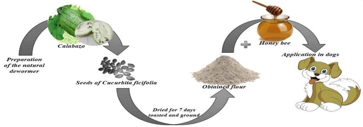
Figure 1. Preparation process of the natural dewormer

Seeds of calabazo ( Cucurbita ficifolia ) were collected aseptically in an approximate amount of 2 kilograms. Then processed according the follow figure.